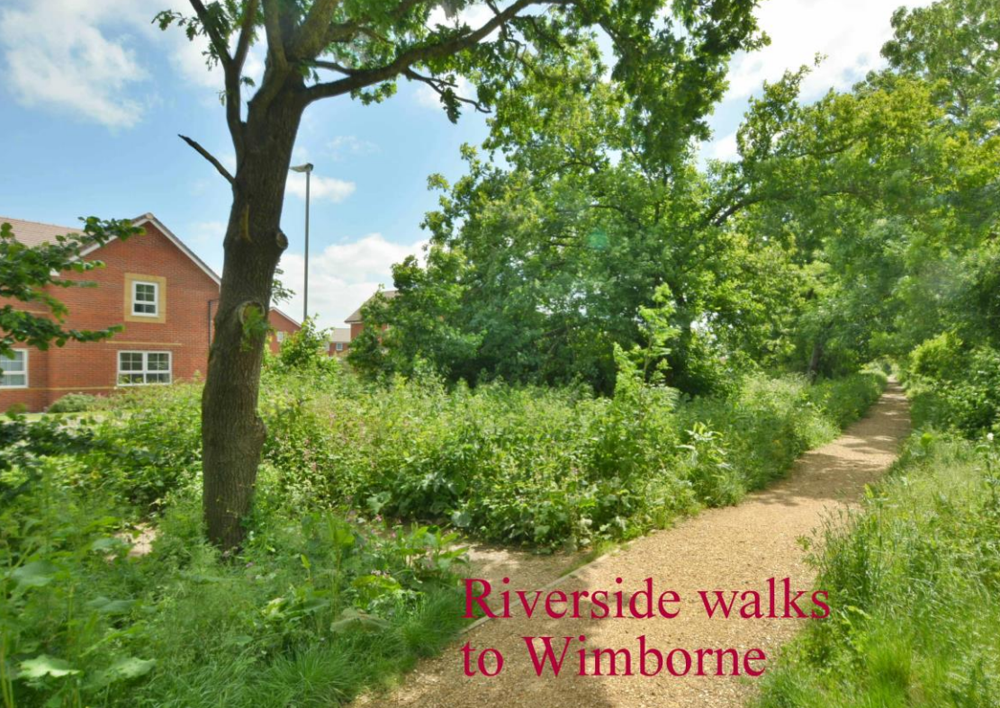
Riverside walks to Wimborne