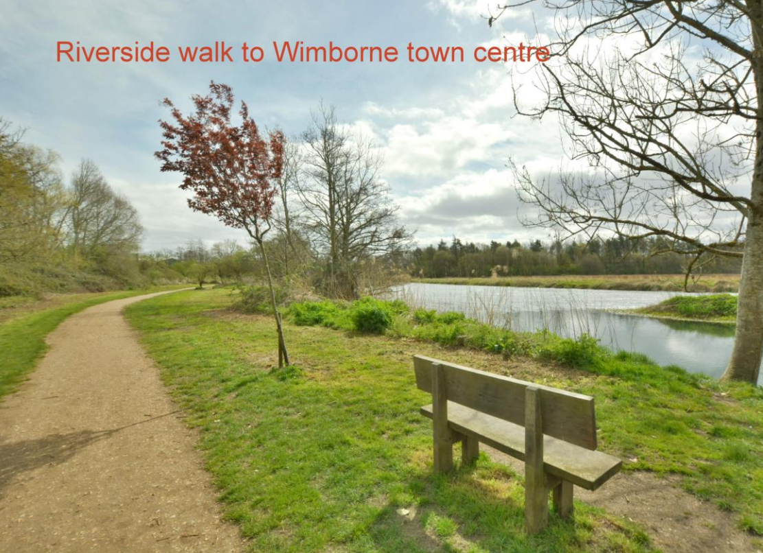
Open area for residents in the development