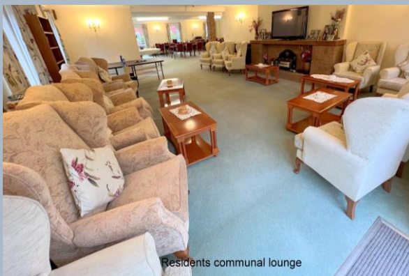
Residents communal lounge