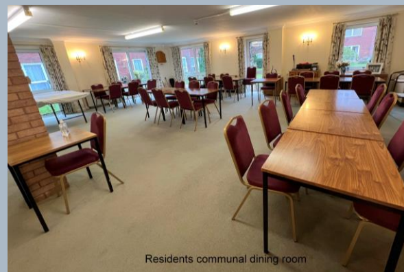
Residents communal dining room