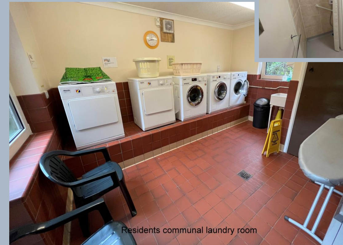
Residents communal laundry room