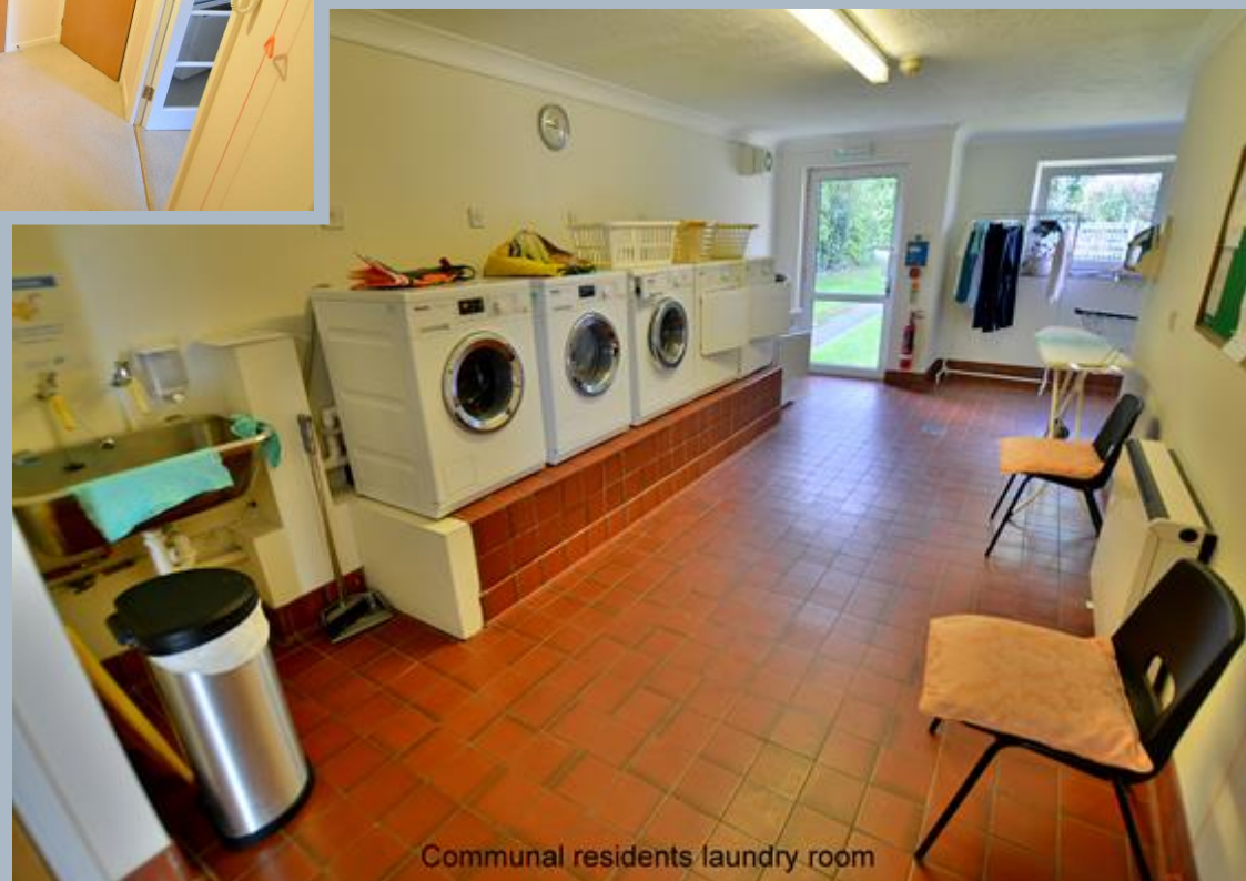
Communal residents laundry room