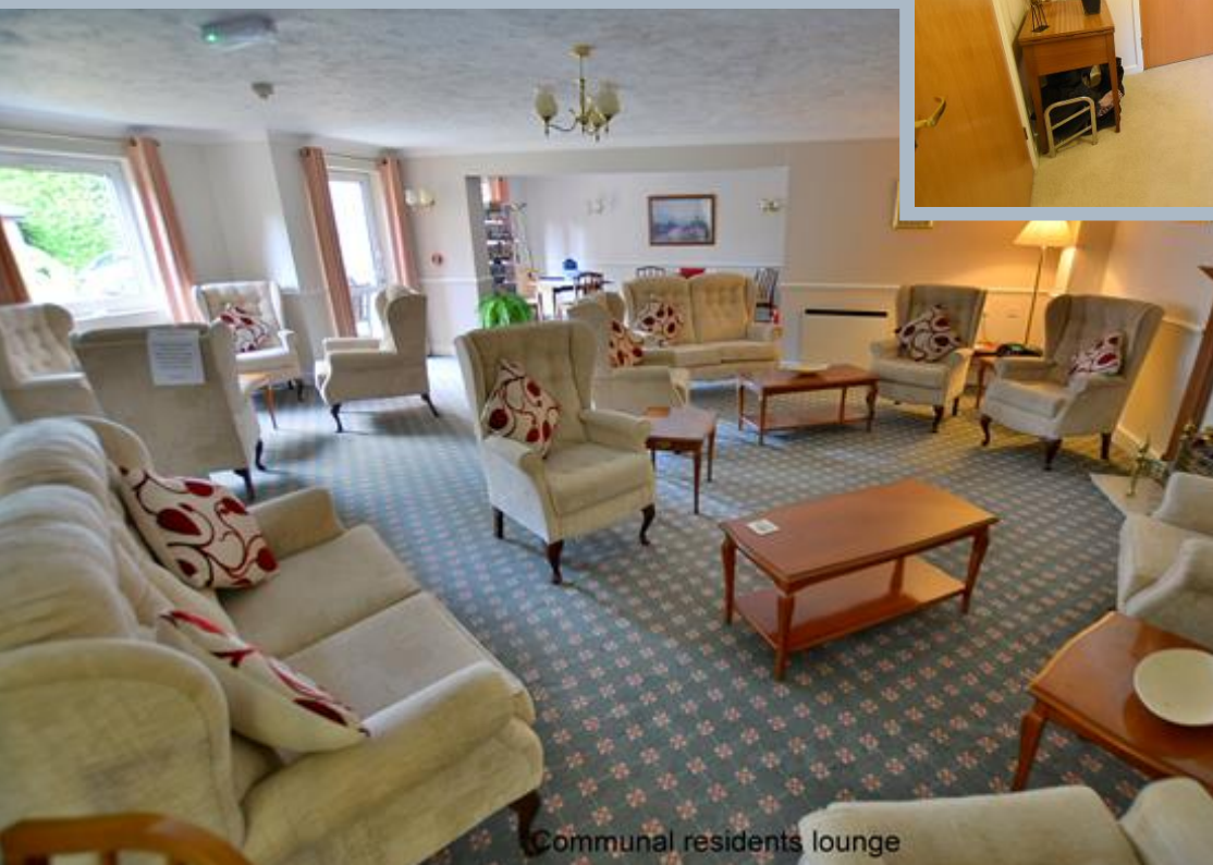
Communal residents lounge